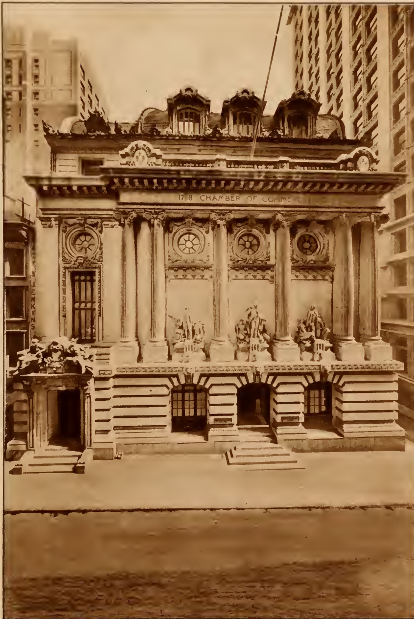
N. Y. CHAMBER OF COMMERCE. This beautiful structure is the home of an association of New York's leading merchants, organized in 1768.